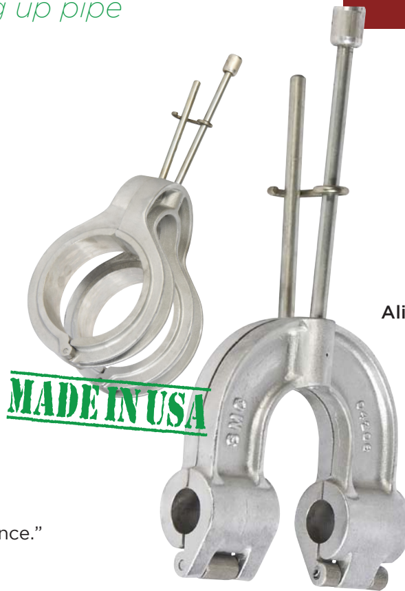
Aluminum Alignment Clamp (253)